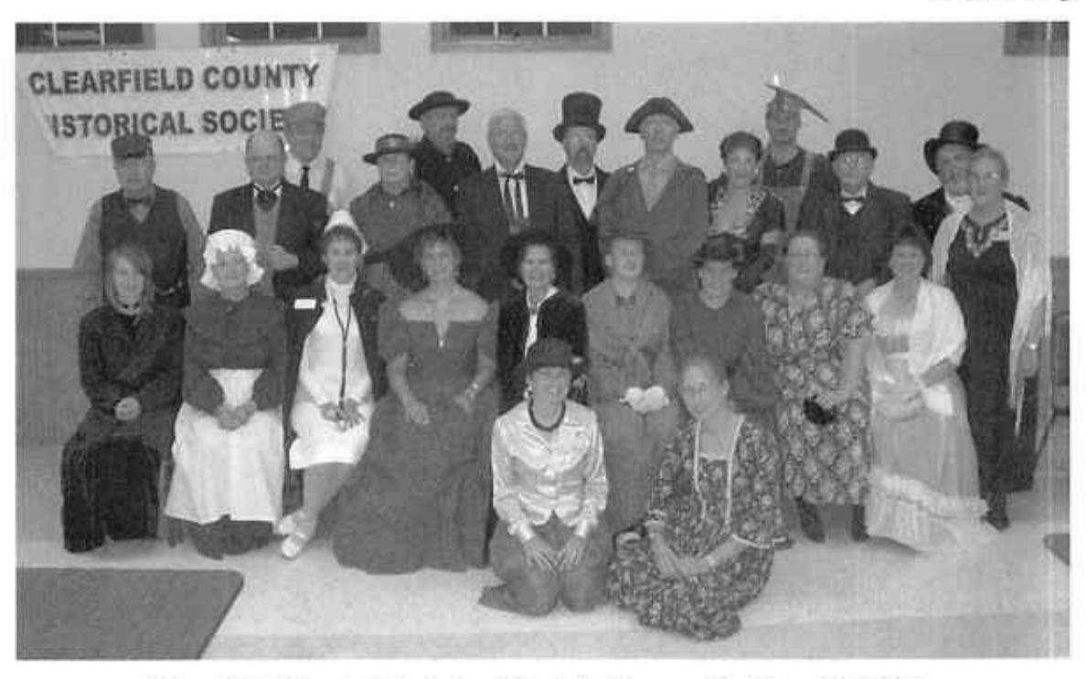
Clearfield County Historical Society Dinner, October 18, 2007